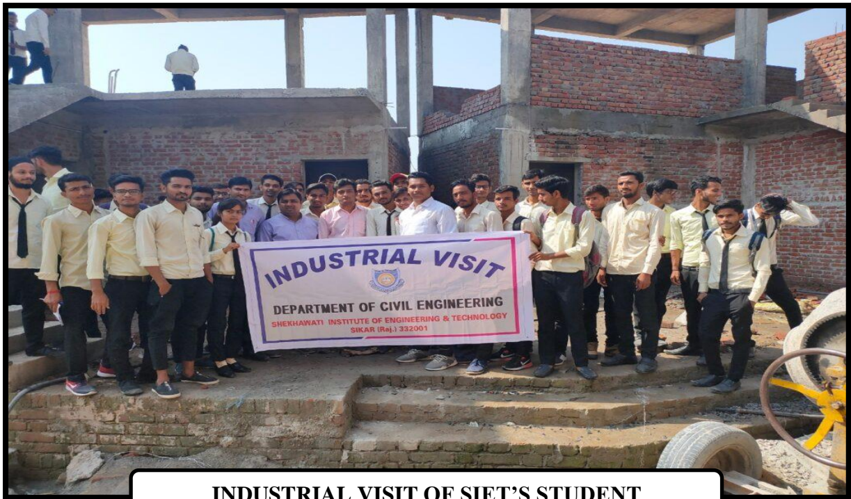
INDUSTRIAL VISIT OF SIET'S STUDENT

An industrial visit for Department of Civil Engineering scheduled on September 25, 2022, to a construction area promises an insightful experience into construction methodologies, site management, and safety protocols. Ensure to prepare adequately for any safety requirements and inquiries about the specific focus areas of the visit and also on same day Department of Mechanical Engineering student went for industrial visit, specifically for mechanical engineering students presents an excellent opportunity to observe practical applications of mechanical principles in real-world settings. It's advisable to confirm the agenda, location details, and any specific requirements for attire or documentation ahead of time to maximize the learning experience. Our SIET students visit around 10 industries per year.