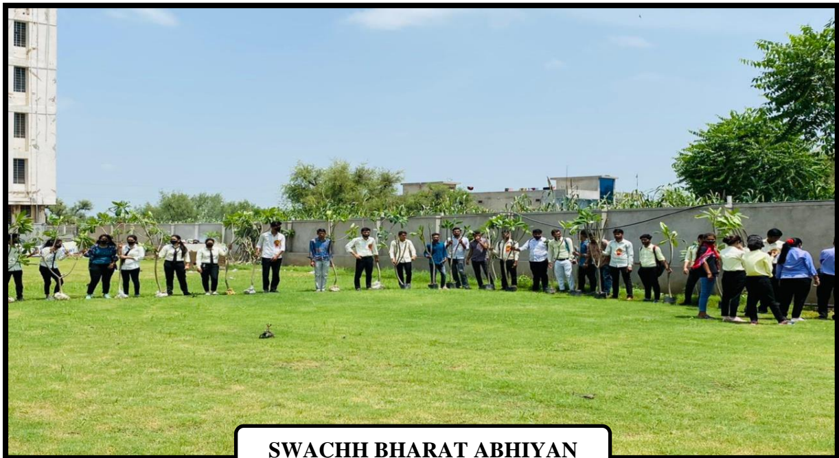
SWACHH BHARAT ABHIYAN

Swachh Bharat Abhiyan is a commendable initiative aimed at promoting cleanliness and hygiene across India. Conducting it in our institute shows a commitment to contributing to this national movement. From September 1, 2022 to September 3, 2022, in Sikar Village, Shekhawati Institute of Engineering and Technology, National Service Scheme (NSS) camp organized a Swachh Bharat Abhiyan. The student group received assistance from the HM and the school's teachers, who gave them brooms and knives for cleaning. Due to ongoing development, the area around the school is covered in shrubs and plastic debris. NSS students reached out to participate in a clean-up initiative at school.