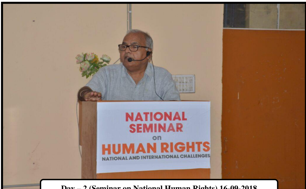
Day – 2 (Seminar on National Human Rights) 16-09-2018