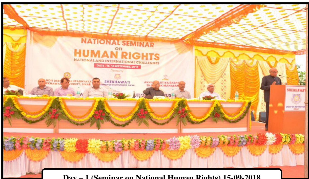
Day – 1 (Seminar on National Human Rights) 15-09-2018