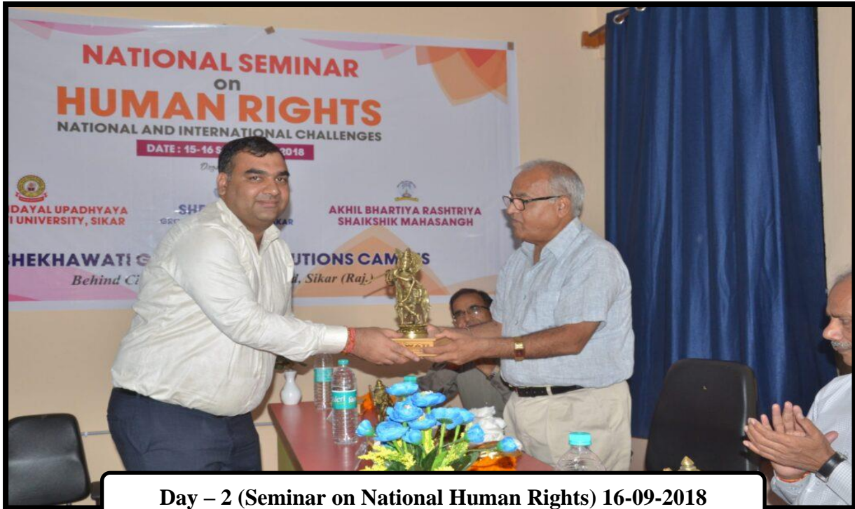
Day – 2 (Seminar on National Human Rights) 16-09-2018