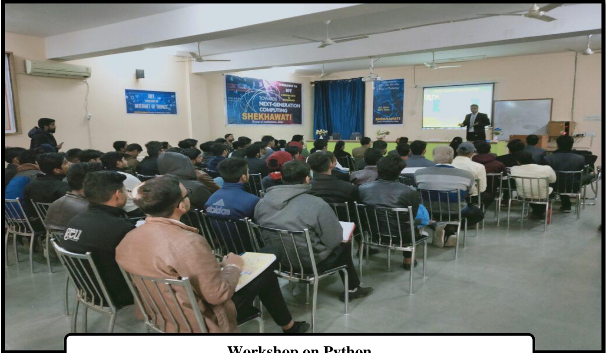
Workshop on Python